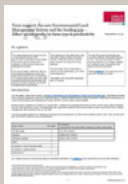
Future Farm Funding Gap Papers

Our rural research team has produced a number of briefings and tools to help inform and guide farmers and landowners at this pivotal time. These can all be found online at our Rural Hub rural.struttandparker.com and include the following: